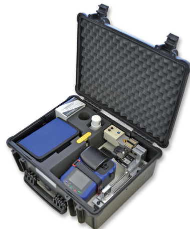
ZEUS D50 HE kit