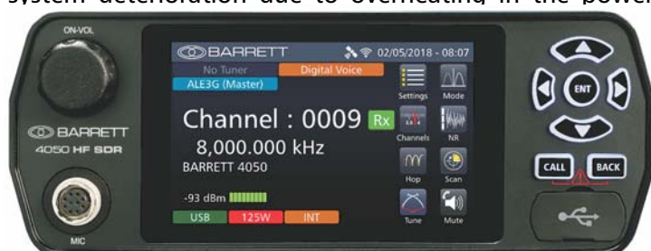
The Barrett 4075 amplifier natively supports the Barrett 4050 HF SDR Transceiver/Exciter

The Barrett ISO9001 Quality Assurance Program ensures consistent performance and the highest reliability.