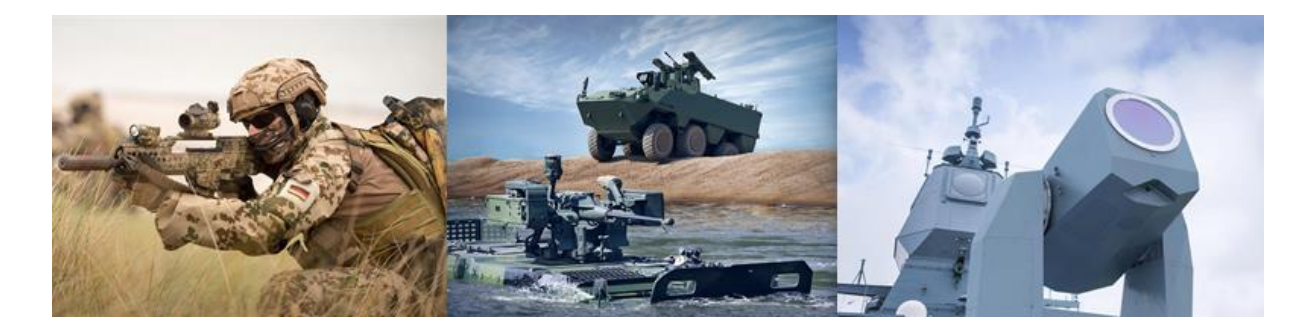
Figure 6: The properties of CFRP enable the material to be used in a variety of applications in defense technology

For some time now, thanks to the properties described above, the defence technology sector has been enjoying the benefits of CFRP as an innovative material. Another consequence of these properties is that the material can be used across a broad range of applications in the defence technology sector. From platforms and structures for rocket and launcher systems to components for military transporters as well as equipment for soldiers and military infrastructure - CFRP has a versatile range of uses. The universal range of applications for carbon composite is another positive reason in favour of using this material in defence technology.