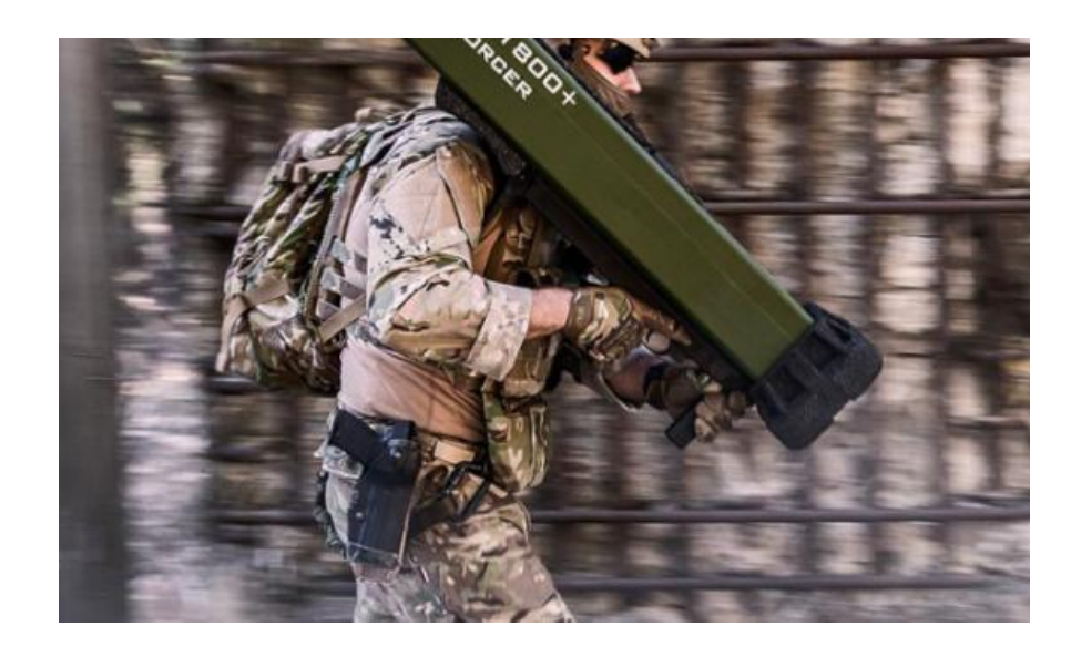
Figure 2: Mobility increase through extremely light launcher systems (MBDA Missile Systems)

In motor sports, the advantages of composites have been known for a long time, and have proven themselves in thousands of applications. Using CFRP not only makes it possible to create aerodynamic shapes that are almost impossible to manufacture using other materials and processes, but it also the key to achieving a substantial reduction in the weight of components and complete units . Using new solutions made of carbon composite makes it possible, when compared to aluminium components , to reduce weight by up to 50% . When compared to steel components that figure actually rises up to 80% . Accordingly, in technical league table terms, CFRP with a density of 1.5 g/cm<sup>3</sup> is significantly lower than aluminium (2.8 g/cm<sup>3</sup>) and steel (7.8 g/cm<sup>3</sup>).