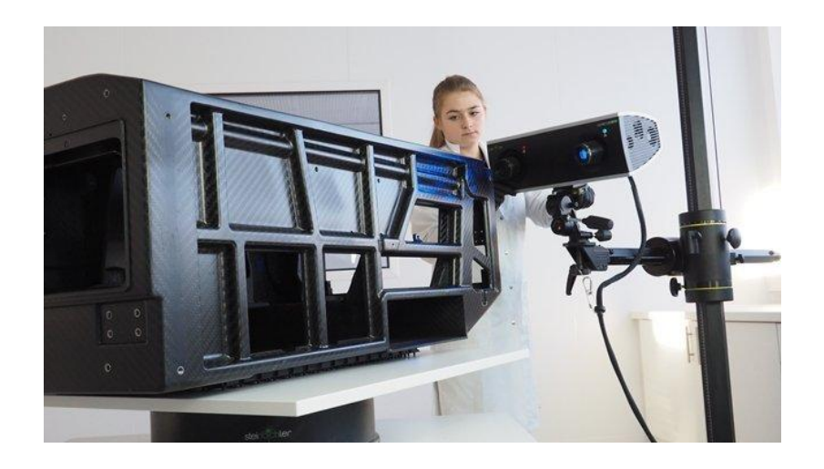
Figure 3: 3D-scanning of a structural component with complex geometry made of CFRP

Composites also set new standards in relation to the size of components: With the production of carbon composite components using prepreg-autoclave technology, larger components can be produced than with the precision casting process. This greatly reduces the number of welded seams, areas affected by thermal expansion.