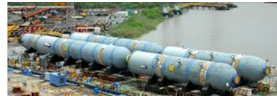
Project cargo & heavy lift transport