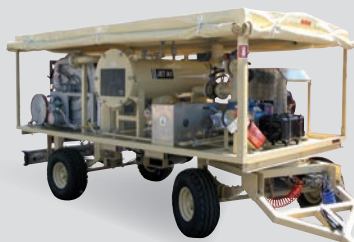
Aviation Fuel Trailer – AFT