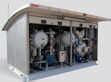
Loading/Unloading Skid – LUS

AMA products range includes a variety of fixed and mobile solutions for fuel storage and transfer operations: