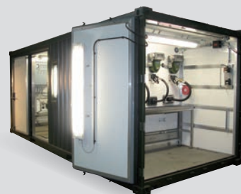
Containerized Dispensing System – CDS