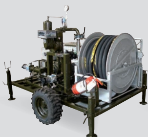
Fuel Transfer Pump – FTP