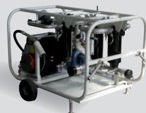
Portable Refueling Pump - PRP